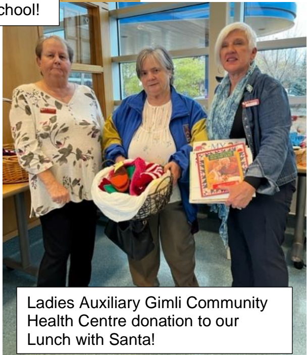
Ladies Auxiliary Gimli Community Health Centre donation to our Lunch with Santa!