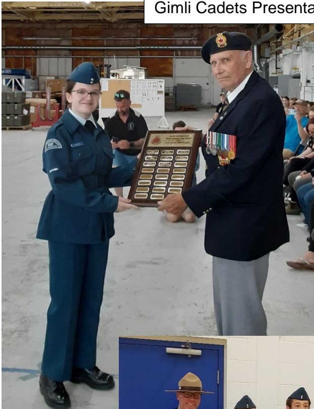
Gimli Cadets Presentation and Donation