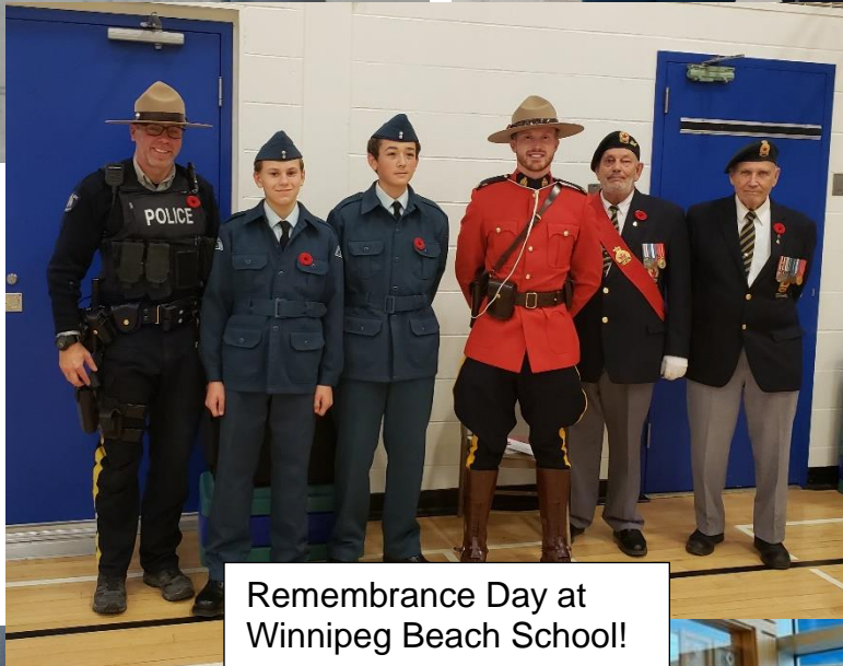
Remembrance Day at Winnipeg Beach School!